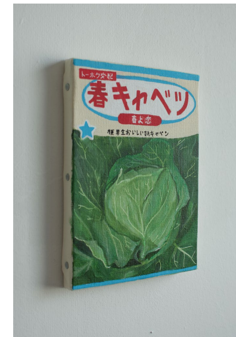
Renée Abaroa 006, 2025 18 x 14 cm Acrylic on canvas