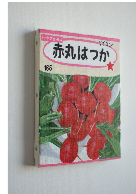
Renée Abaroa 008, 2025 18 x 14 cm Acrylic on canvas