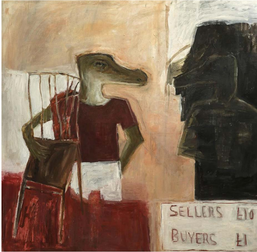
Layla Andrews I Still See You Here, 2025 Oil on canvas 152 x 152 cm