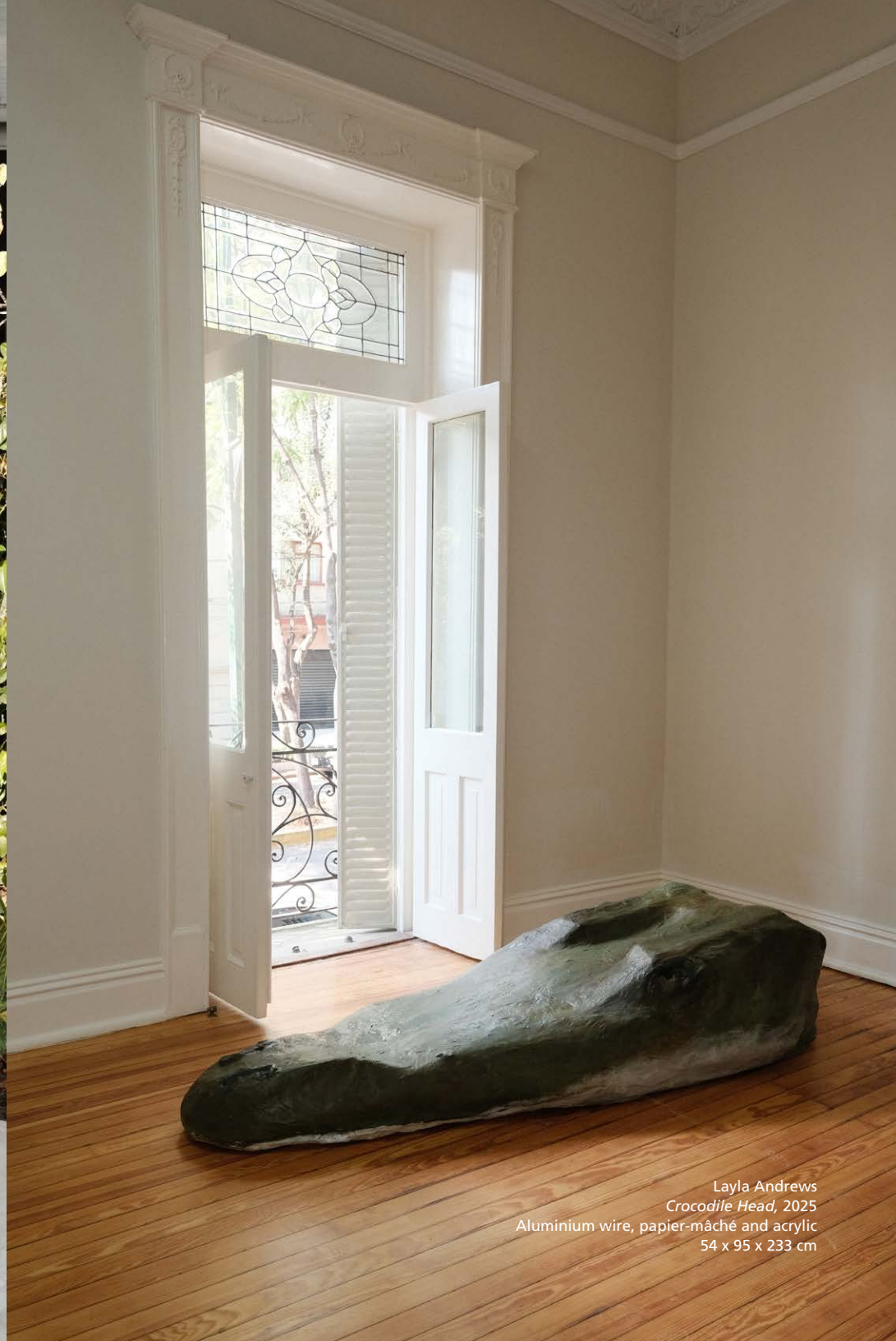
Layla Andrews Crocodile Head , 2025 Aluminium wire, papier-mâché and acrylic 54 x 95 x 233 cm